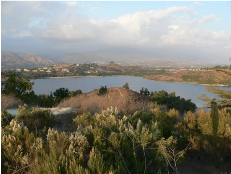
Frank G. Bonelli Regional Park and Puddingstone Lake